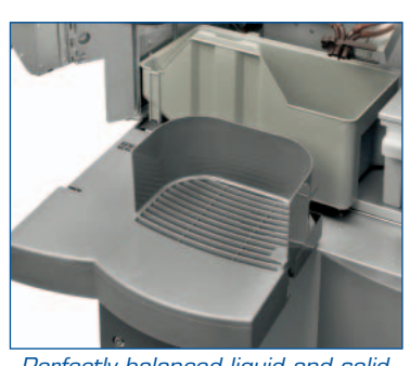
Perfectly balanced liquid and solid waste containers