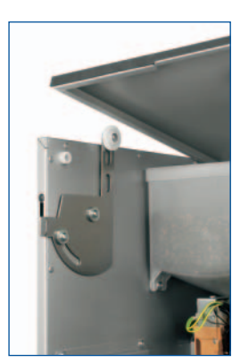
New system ensures top panel is not left open after ingredient filling