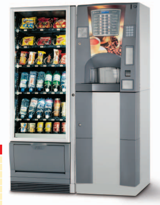
Banking with Snakky and Snakky SL thanks to the plinth kit.