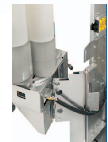
Easy internal access, even when banked, due to the 180° opening of the cup turret with double hinge