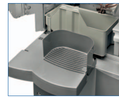
(approx. 1,100 coins)